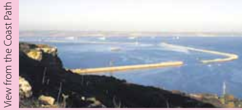
View from the Coast Path

This footpath takes you down a steep, uneven descent to join the disused railway line below. This unique landscape altered by landslips and quarrying is rich in archaeology and wildlife. Keep a look out for the herd of feral British Primitive goats which have been reintroduced to help