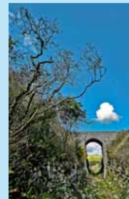
Top of Yeates Incline

joins up with the Yeates Incline. Volunteers have been opening footpaths and revealing original features such stone water troughs for the horses and track surfaces. The Verne Citadel, now a prison dominates the landscape as well as the three bridges in a row which mark the Yeates Incline.